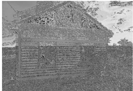
West wing project pictures